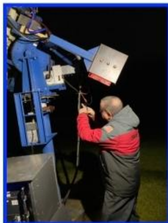
HMM LIQUID COOLED!