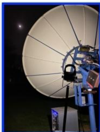
CLOUDY, BUT THAT'S THE MOON