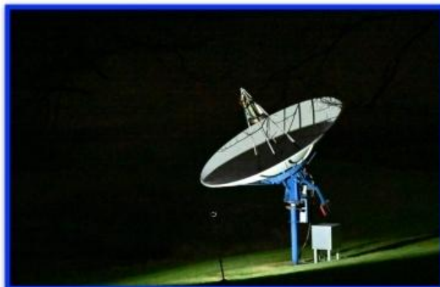
14' DISH FOR ON 1296 & 2304 GHZ DIESEL OIL COOLED

For L band, 600 W with an antenna gain of 30 dbi gives +57 dbW EIRP or 500KW. For S band, 60W and 34 dbi gain for an EIRP of +51 dbW or a little more than 100 KW