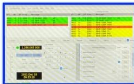
WAYNE WORKED RD4D & LZ1DX

In October thru December made 13 contacts on 2304 88 contacts on 1296